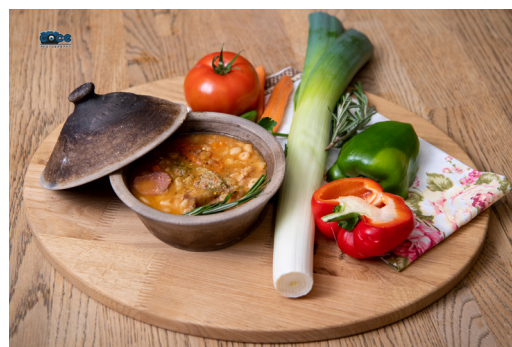
Grah / Pasulj